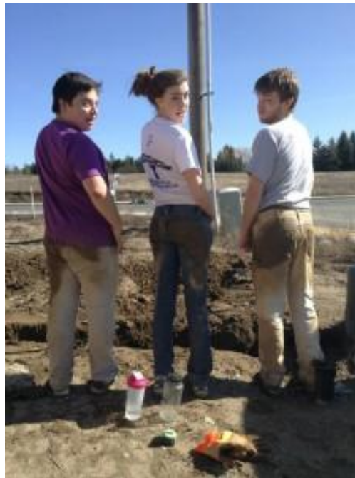
Everyone enjoyed eating lunch on the comfortable driveway!